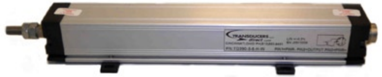
SERIES: TD390 (6 to 56" stroke lengths)